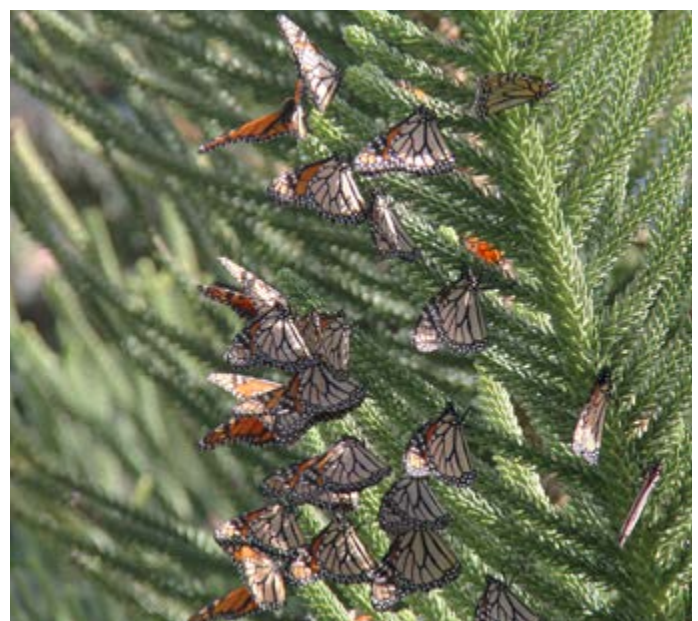
Hundreds of Monarch butterflies fly around the large trees and shrubs in the gardens adjacent the Golf Club entrance.

Margaret says they are most active in this area in the mornings, when the sun shines directly on their overwintering spot. She also remarked that the phenomenon has attracted many visitors to view them. If you are going to check them out, please remember that you are on private property and don’t get too close to them.