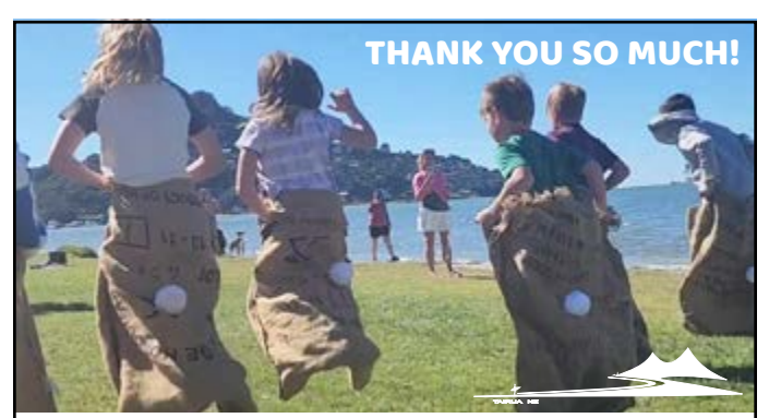
All the bunnies from Tairua Information Centre would like to thank all the families who took part in the Easter Sunday Funday. Everyone had a great time hunting for Easter Rocks and eating lots of Chocolate. Thank you for all your support.